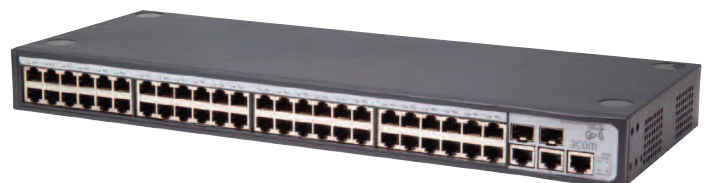
3Com Baseline Switch 2250 Plus

In addition, the web interface features individual port-traffic monitoring (port mirroring) and a unique, quick-glance switch status review. A cable diagnostic tool lets users troubleshoot basic connectivity problems via the web management interface further simplifying network installation.