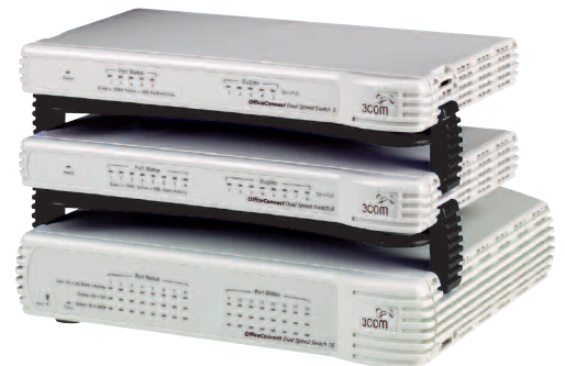
from top: OfficeConnect Dual Speed Switch 5, Switch 8 and Switch 16

Silent operation. Self-cooling fanless design ensures there is no noise disturbance from the switches.